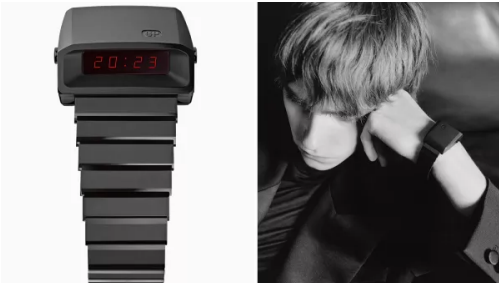
Saint Laurent partners with Girard-Perregaux for first watchmaking foray