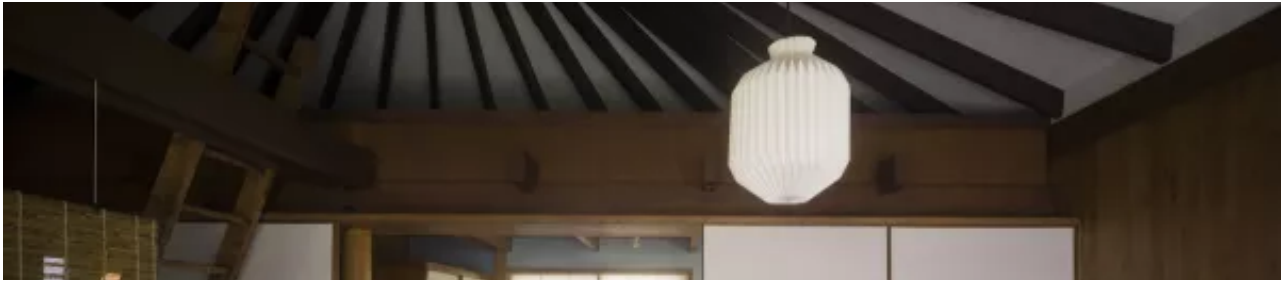
Umbrella House by Kazuo Shinohara opens at Vitra Campus