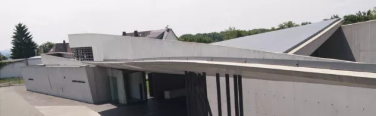
'Prima' installation by Zaha Hadid for Swarovski at the Vitra Campus