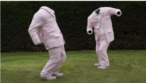
Erwin Wurm's pop-coloured fantasy land at Yorkshire Sculpture Park